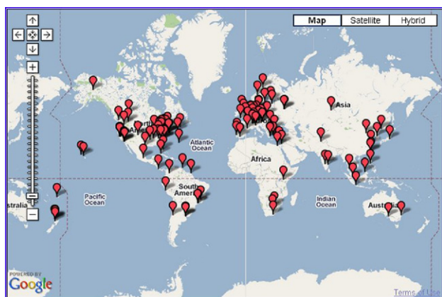
Figure 1. Google map showing locations of all RNGs that have been in the network and contributed data. The distribution depends on Internet infrastructure. (Color version of figure is available online).

Figure 1 shows the location of host sites in the network, which grew to approximately 60 nodes in the first years of the Project, and since 2004, has been relatively stable with 60 to 70 operational nodes. We rely on volunteers to host and maintain the RNG device and software at each node. The geographical distribution of nodes is constrained by infrastructure limitations. Although we aim for a world-spanning network—ideally a deployment representative of world population densities—network coverage is poor in areas where Internet access is limited. For example, we do not have coverage in many parts of Africa and Asia.